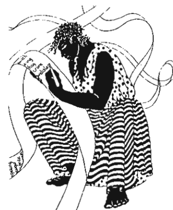
WEBSTER: Unwinding the bindings of nummed/numbified words